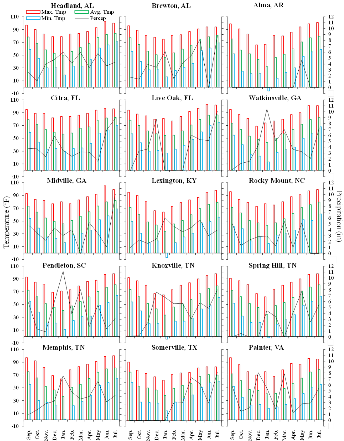
Figure 1. Temperature and precipitation averages by month across the cover crop growing season (Sept. 2023 – July 2024) for sites participating in the Southern Cover Crop Variety Trial.